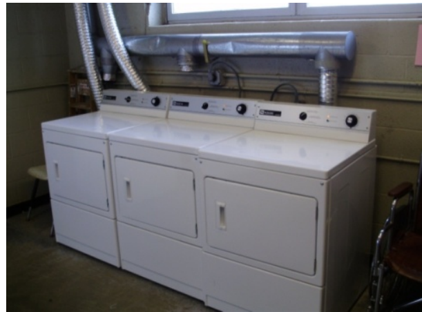
Three new washers in Haven Center

"Our mission at Open Door is leading people in the adventure of becoming like Christ, and Christ was known for serving people. Volunteer projects like this one give us the chance to have fun and fulfill our mission. When we heard about the need and understood the potential for the Haven Center laundry room. We got excited about the long-term effect we could have. We saw it as a chance to reflect God's love for our community and jumped to help an organization that does so much good in the community. Also, we like to use power tools!"